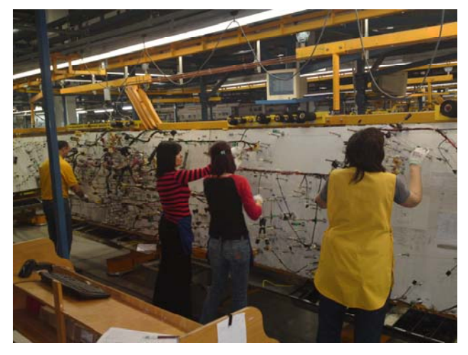
Figure 1. An example of workers activities during the shift

Traceability of products and completion of certain phases of assembling is very well conducted. It is exactly known when the product moves from one operation to another. There is software - technical solution which is developed for this purpose. However, the problem arises in monitoring the activities of workers in the process of assembling. The reason for this is because there are no mechanisms for monitoring the activities of workers during the shift, and there is no solution for monitoring the performance of activities at certain operations (Figure 1). For quality control there are also workers that control processes.