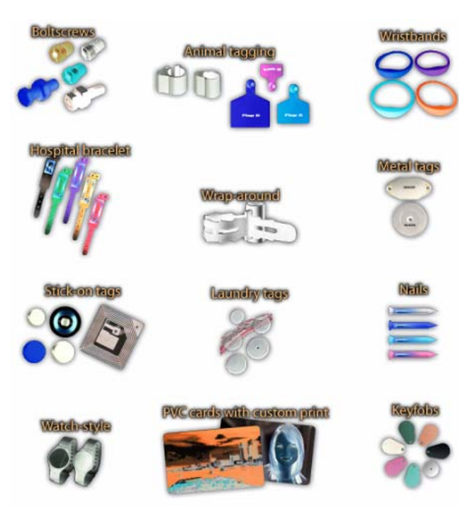
Figure 4. Wide range of RFID tags [9]