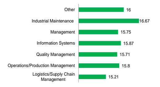
Figure 1. Average classifications by IEM functional area

In order to develop an deeper understanding of the University data, we divided the areas of IEM internships into in seven representative functional domains: (1) Logistics / Supply Chain Management; (2) Operations / Production Management; (3) Quality Management; (4) Information Systems; (5) Management; (6) Industrial Maintenance; and (7) Others (including internships conducted in the areas of Ergonomics, Energetic Efficiency, Human Resources, Marketing and Industrial Costing). Figure 1 presents information about the average classifications obtained by students who conducted internships in each IEM functional area. The average classifications obtained were of 15.59 for male students and 15.76 for female students.